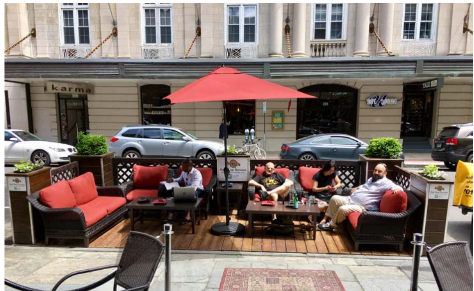
A Terrasse in Action!