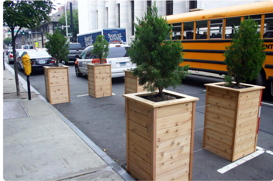
Meat & Co., Crown Street

Barriers are meant to demarcate the seating area provided for tables, chairs, and umbrellas. The bollards are a wooden design with chains or cables connecting each individual bollard to protect diners. The bollards can be rented or purchased from the Town Green District or built by the establishment, as per the standard design, with the option to be stained with one of the stain colors below.