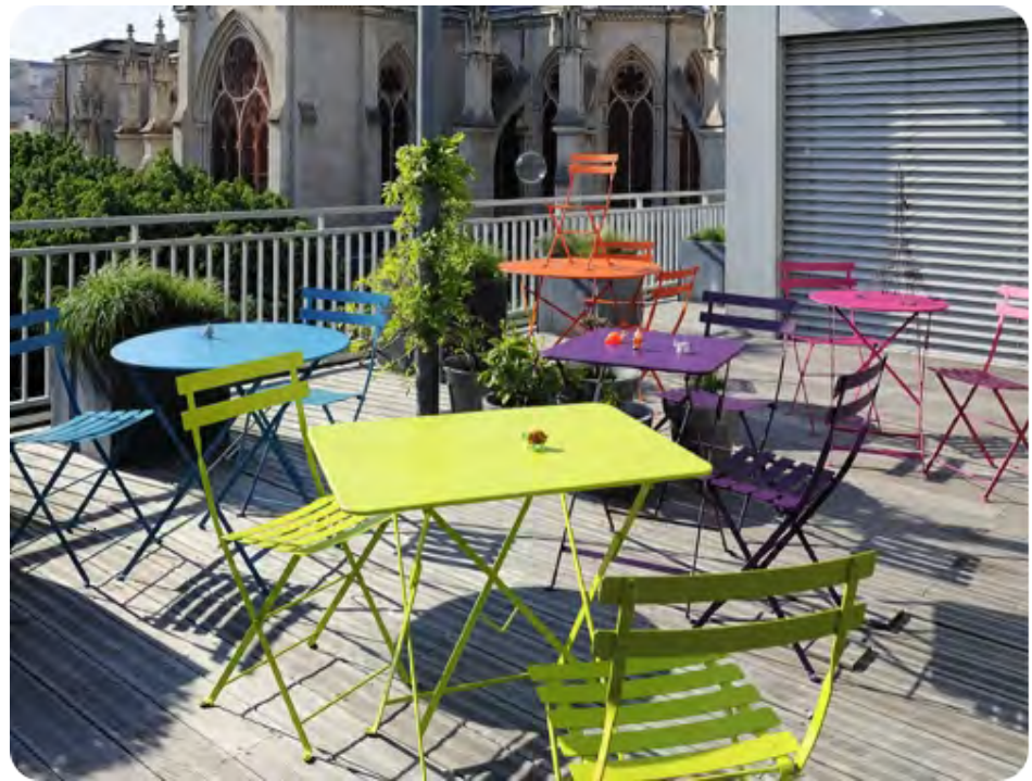
Figure 6. Colorful Bistro Furniture to choose from.